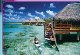
Manihi Pearl Beach Resort