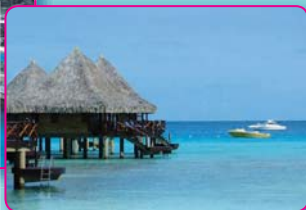
Kia Ora Rangiroa