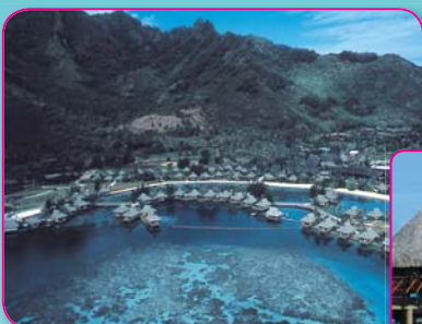
Moorea Intercontinental Resort