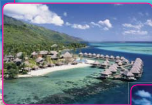
Moorea Pearl Resort