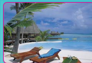
Tikehau Pearl Beach Resort