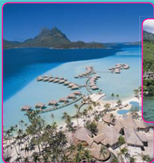
Bora Bora Pearl Resort