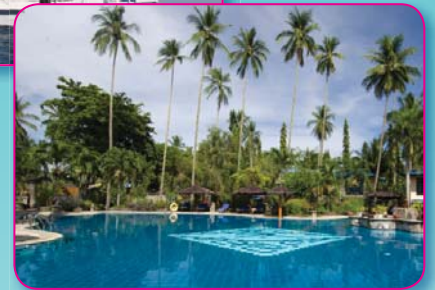
Tasik Ria Resort