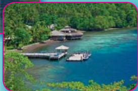
Kungkungan Bay Resort