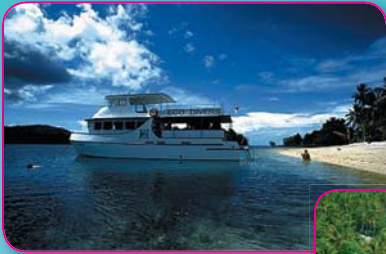
Eco Divers Manado

Volcanoes, rain forests, rice paddies and friendly island culture are found on the lush island of Indonesia. Manado's reef and dramatic walls are laden with corals and are home to varied marine life including reef sharks, napoleon wrasse, giant clams and mudibranchs.