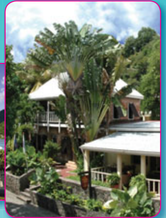
Old Gin House, St. Eustatius