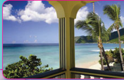
Sebastian's on the Beach, Tortola